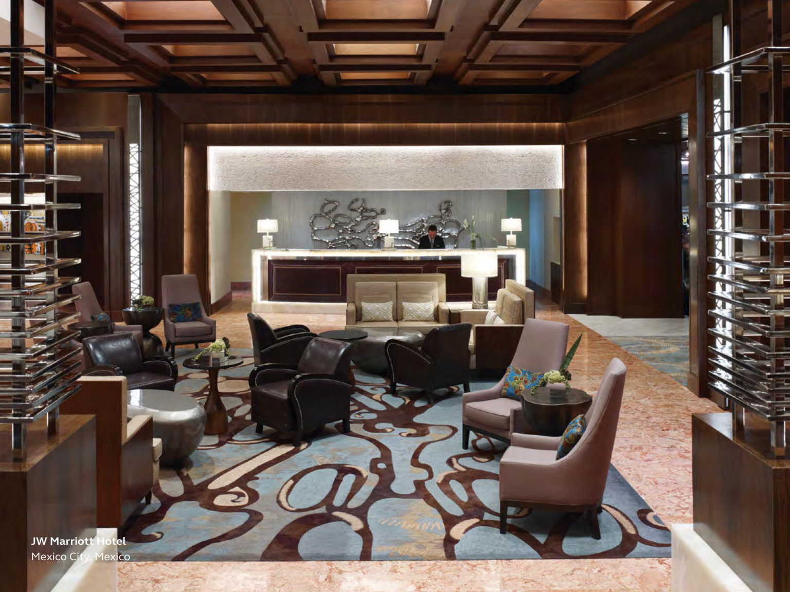
JW Marriott Hotel Mexico City, Mexico