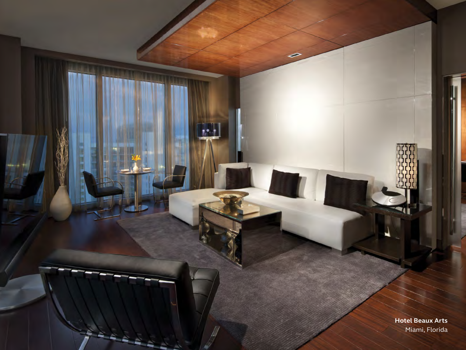
Hotel Beaux Arts Miami, Florida