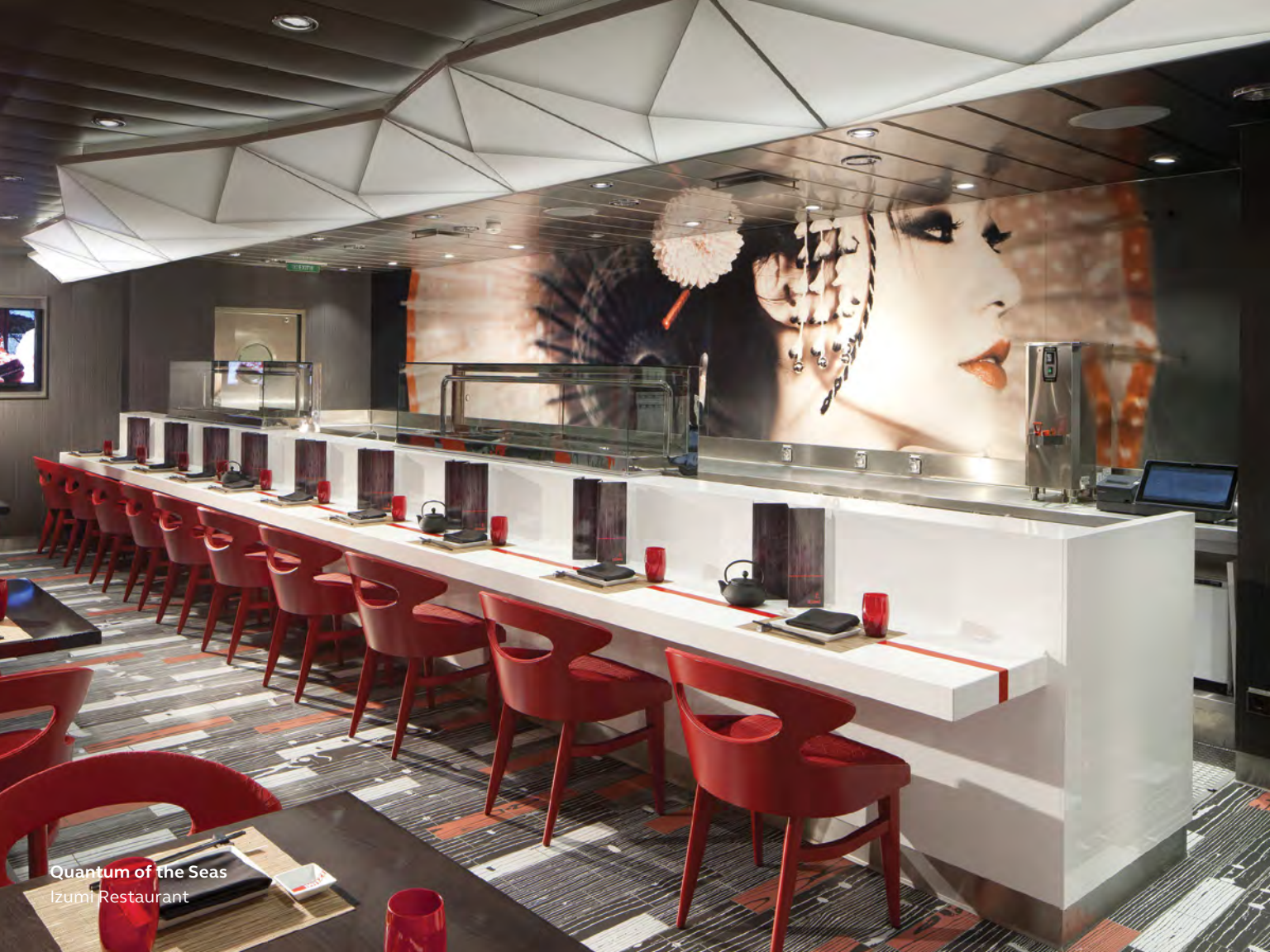
Quantum of the Seas Izumi Restaurant