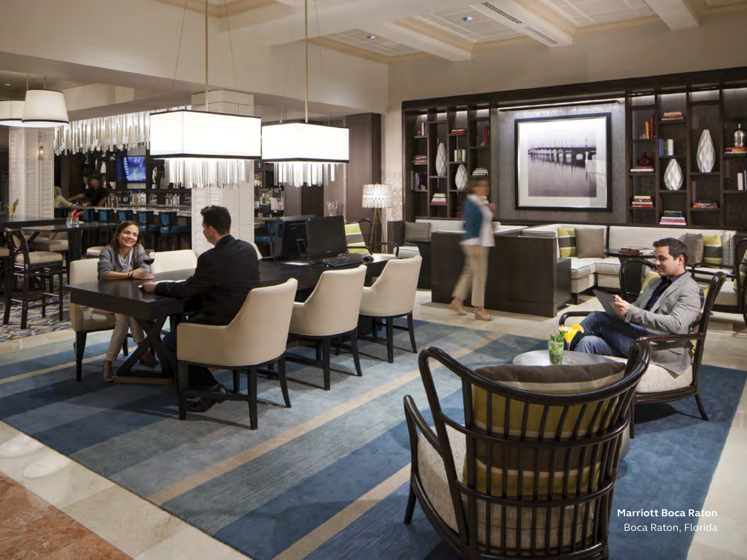
Marriott Boca Raton Boca Raton, Florida