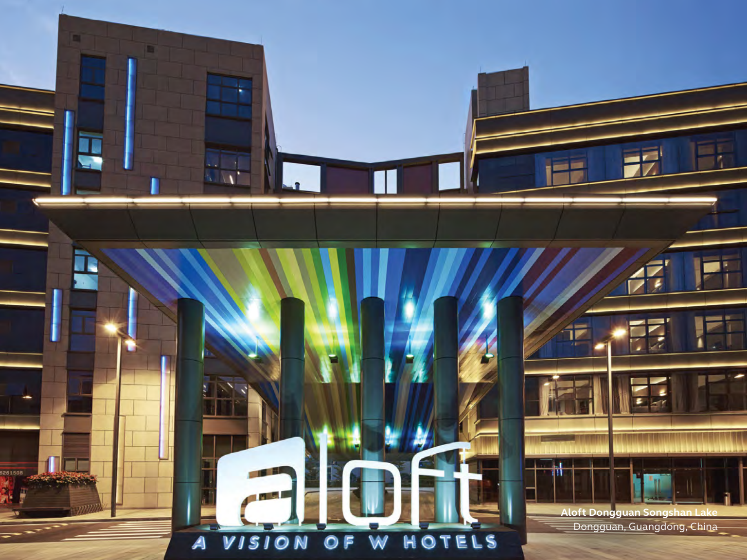
Aloft Dongguan Songshan Lake Dongguan, Guangdong, China