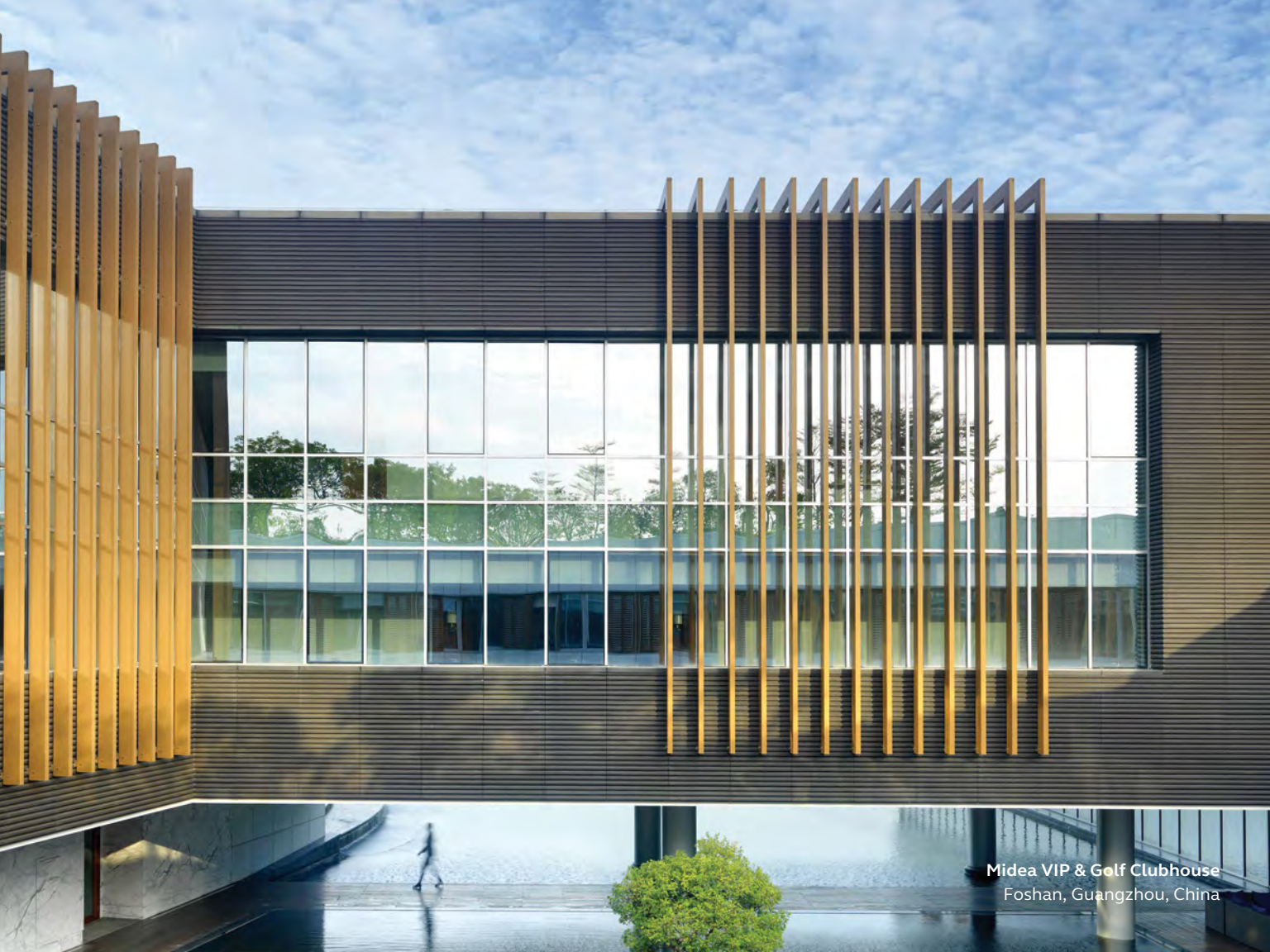
Midea VIP & Golf Clubhouse Foshan, Guangzhou, China