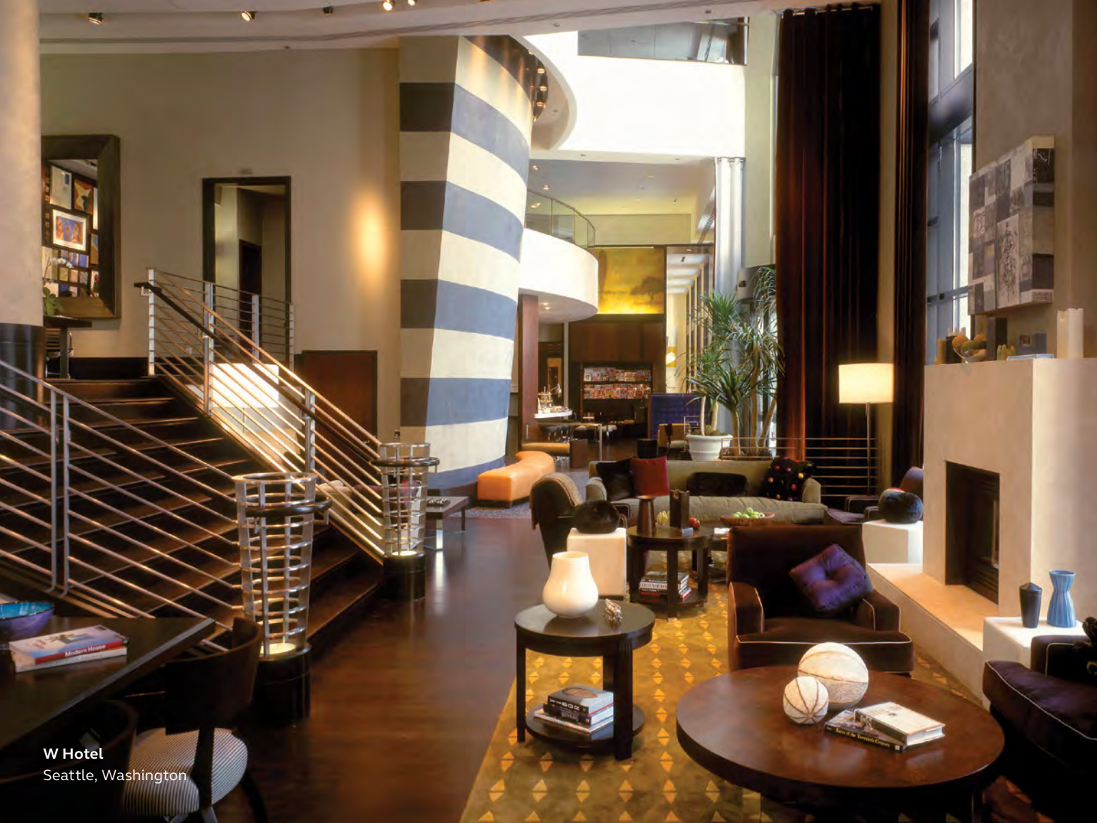
W Hotel Seattle, Washington