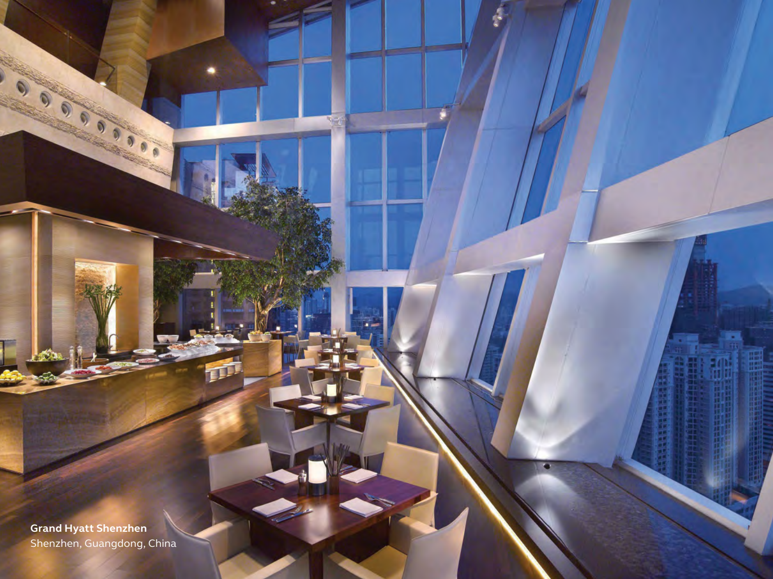
Grand Hyatt Shenzhen Shenzhen, Guangdong, China