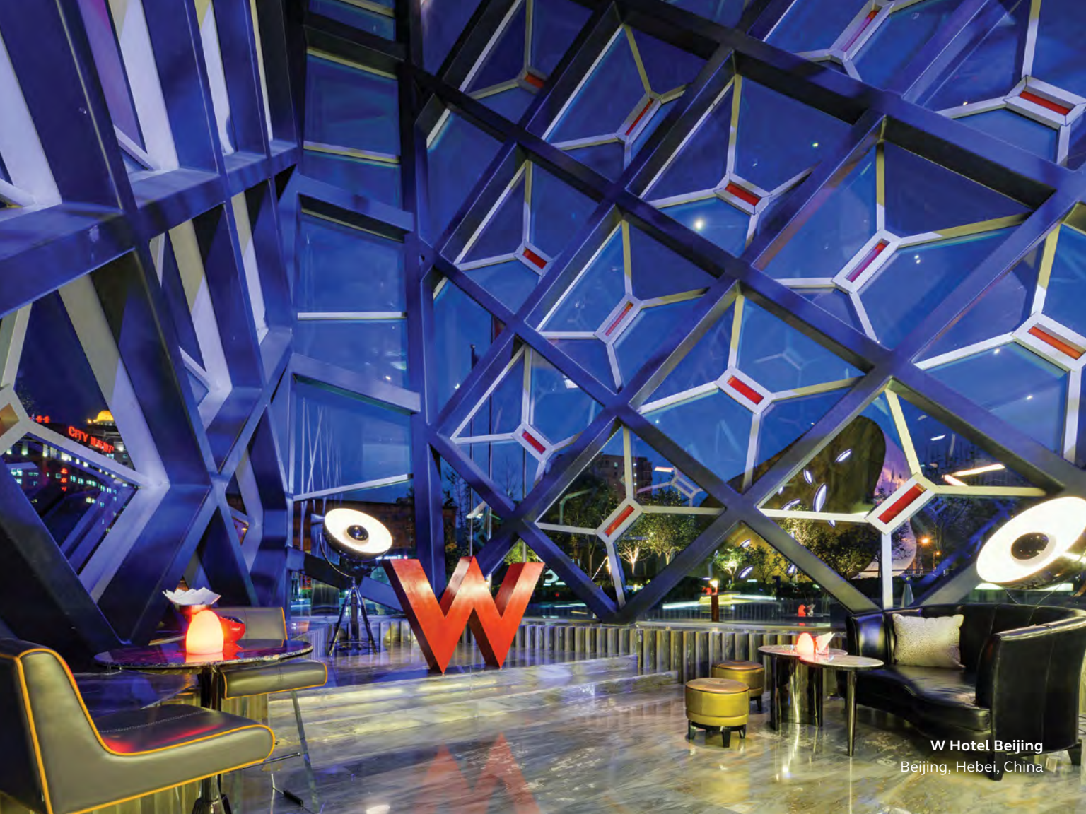
W Hotel Beijing Beijing, Hebei, China