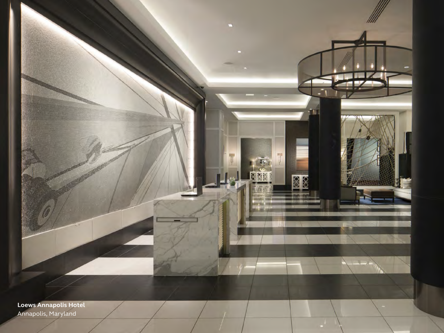
Loews Annapolis Hotel Annapolis, Maryland