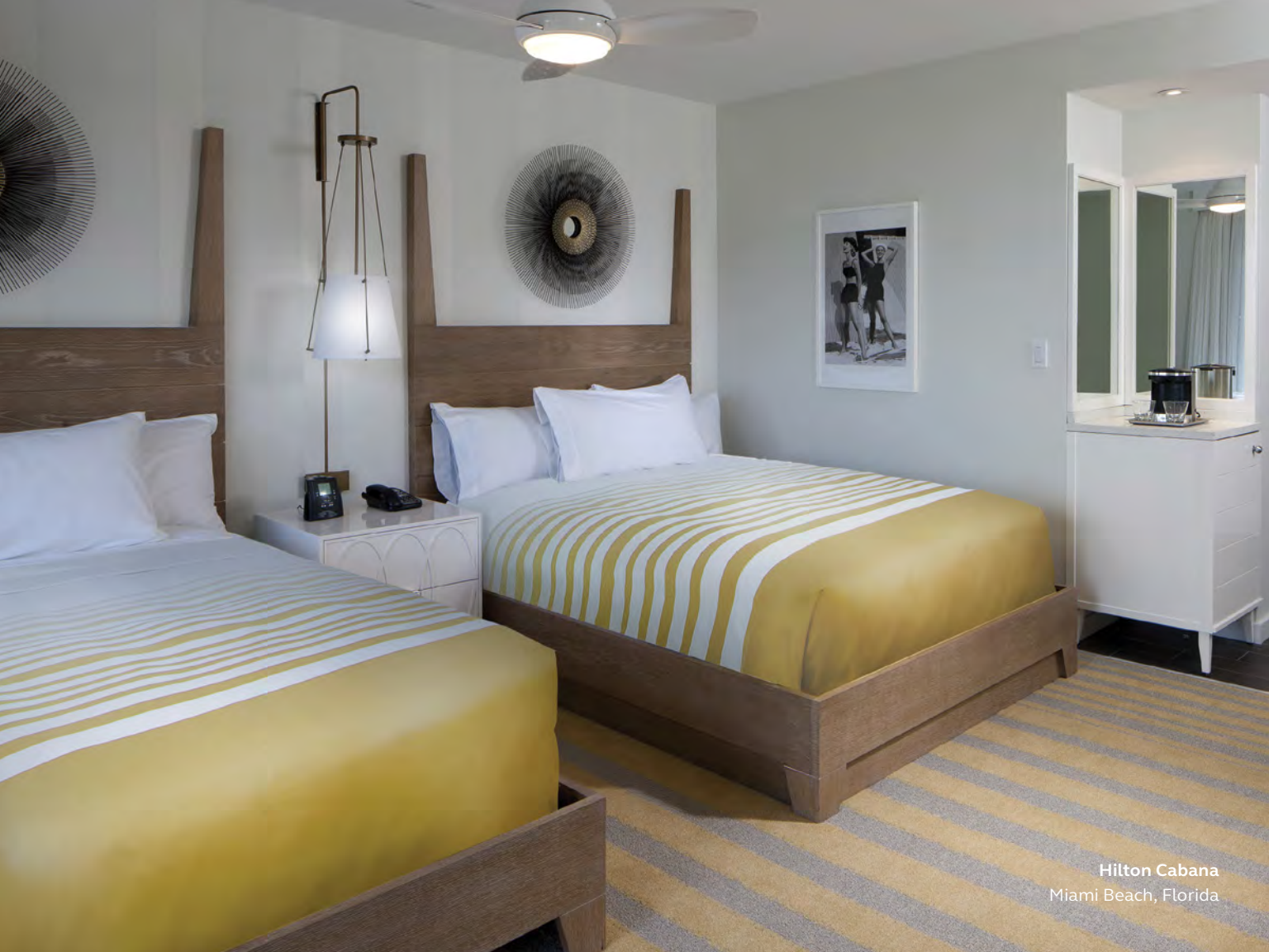
Hilton Cabana Miami Beach, Florida